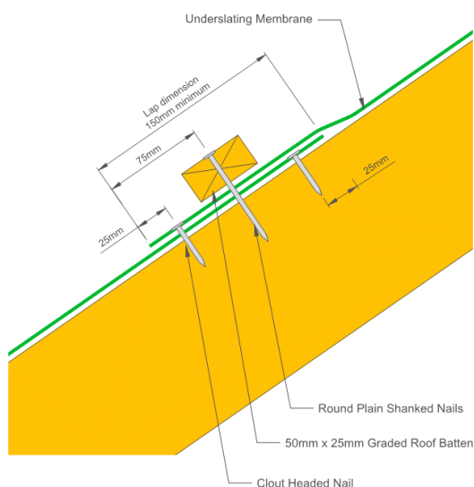
Figure 2: Creating the Overlap - Battened Overlap Detail

When being used unsupported, the roofing membrane should achieve a nominal 10mm drape in between the support positions in order to prevent contact with the underside of the tiles, thus avoiding the transfer of wind loading to the primary roof covering. The drape also serves as drainage for water within the batten space to the eaves position and into the gutter. Fully supported membranes i.e. installed over sarking boards must incorporate counter battens.